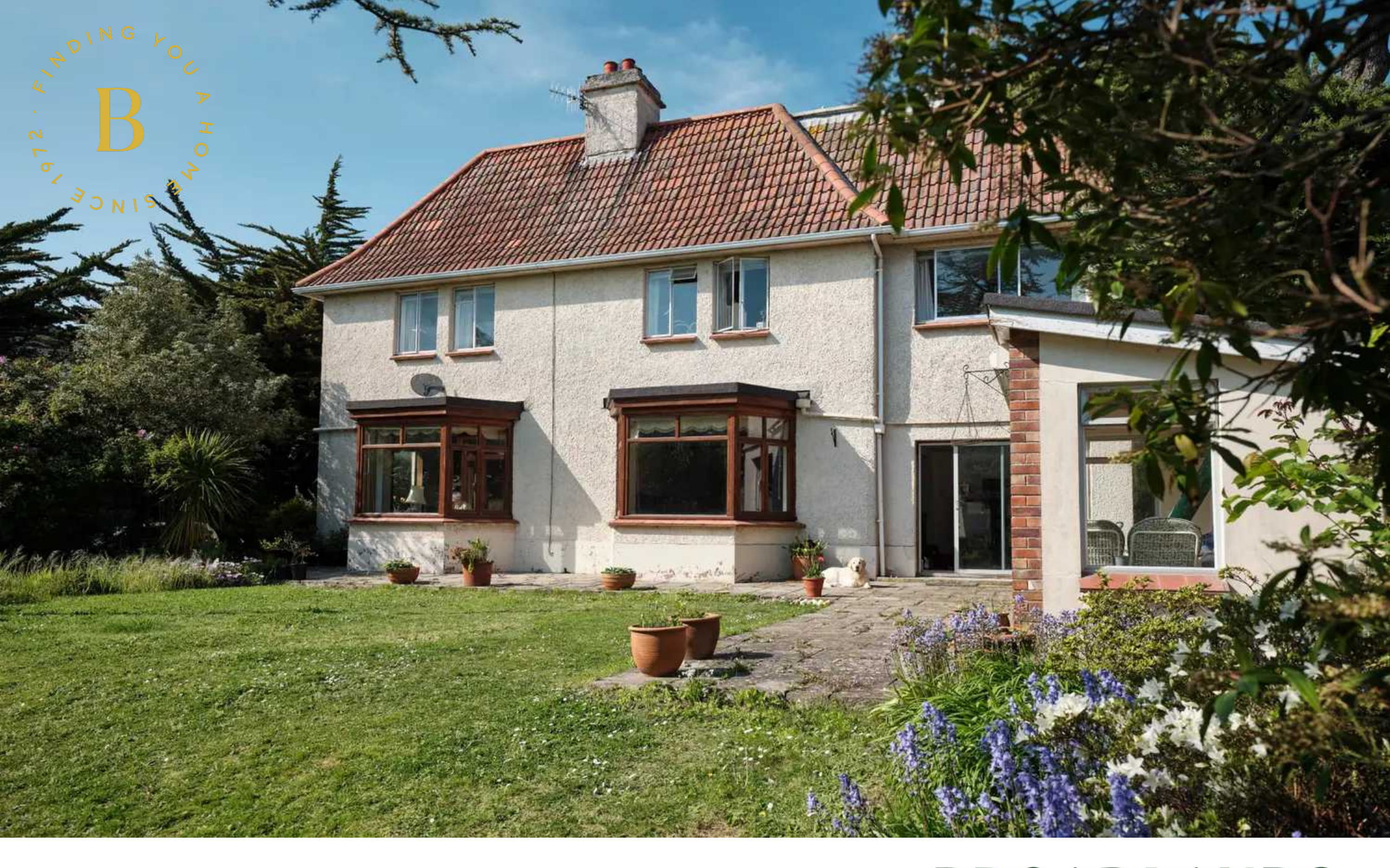
Te Whare, Le Mont Millais, St. Helier Asking Price £1,495,000